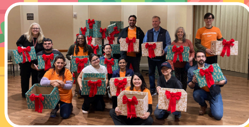
Amazon Fremont team members helping wrap packages for home-bound seniors!

MBBP teamed up with the Area Agency on Aging and SOS Meals on Wheels to pack Holiday Boxes for isolated seniors across the county. Corporate volunteers and Alameda County supervisors delivered the gifts to recipients' homes. Highlighting the power of community, these boxes made the season brighter for many!